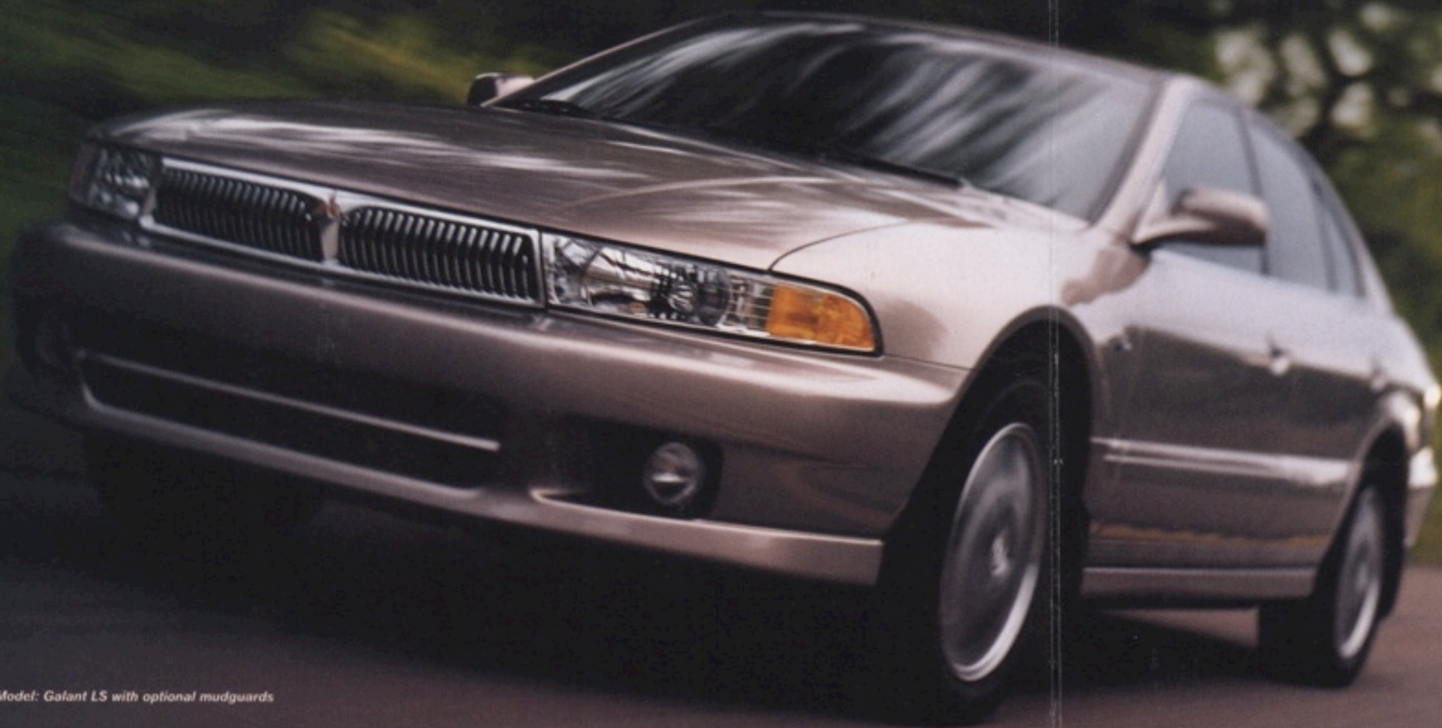
Model: Galant LS with optional mudguards

If you're the shy type, consider this a warning.